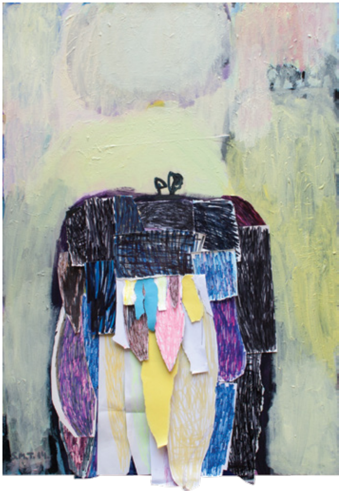
Slikala sem sonce kombinirana tehnika na platnu 73 x 50 cm