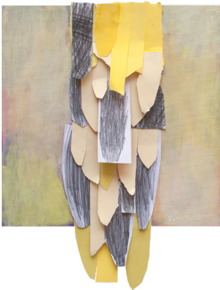
Sonce kombinirana tehnika na platnu 38,5 x 30 cm