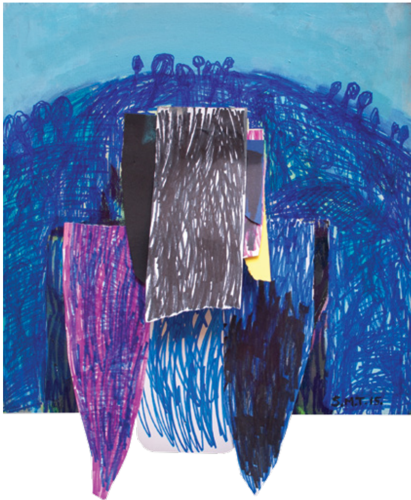
Modra noč kombinirana tehnika na platnu 49 x 40 cm